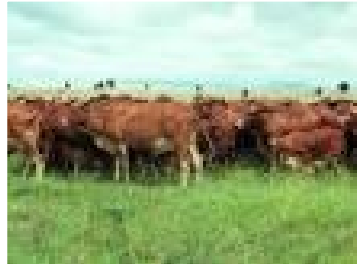
Nangaramo multiplication unit

The Region has 167,200 cattle, 226,077 goats, 15,886 sheep, and 1,134,864 chickens The Region aims to improve its ranch in order to increase the number of cattle and milk production, The proposed area for development is 8000 Ha.