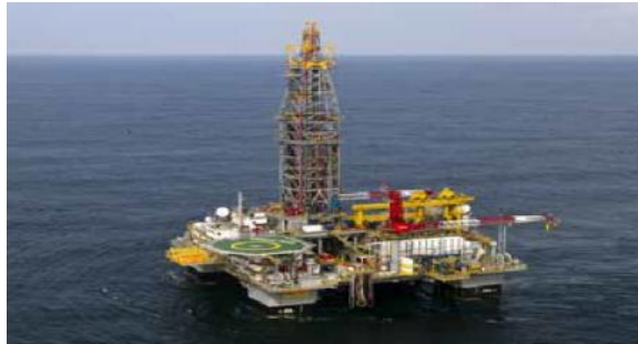
Natural Gas extraction from Msimbati village.

Currently there are giant companies includes BG, Statoil,Orphir, drilling, and later producing oil and transportation of natural gas from Msimbati and Mnazi Bay fields to Dar es salaam.