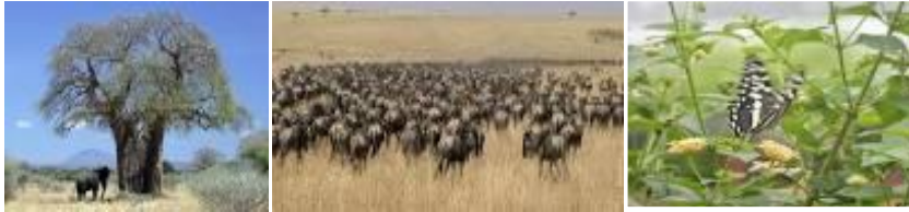
Wildlife found in Msanjesi (Elephant, Butterfly, Monkey and water bug )

These are Msanjesi with a size of 444 km 2 (44,425 Ha.) and Lukwika/Lumesule with a size of 220 km 2 , (21,025 Ha) both of which are in Nanyumbu district.