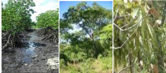
1. Mangrove forest, 2.&3.Miombo woodlands

The region has fifteen (15) forest reserves which are under the management of Central Government, four (4) forest reserved under the management of District councils and 21 forest reserves under the management of the community or village government ( community based forest management ).