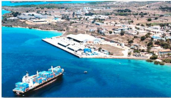
Mtwara sea Port

We believe that if the appropriate measure and incentive are put in place Mtwara port can easily absorb over 1,500,000 tons per year .The currently oil storage capacity is 34, 000m 3 .